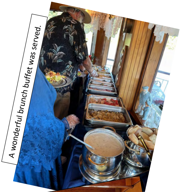
A wonderful brunch buffet was served.