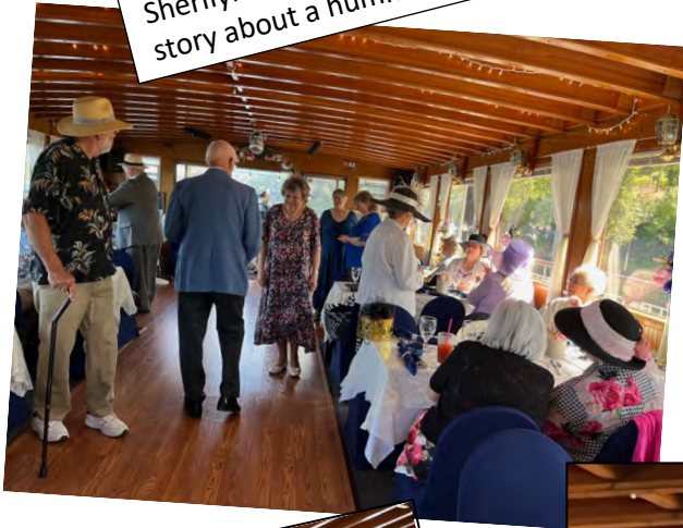
It was so good to be together again and catch up with friends!