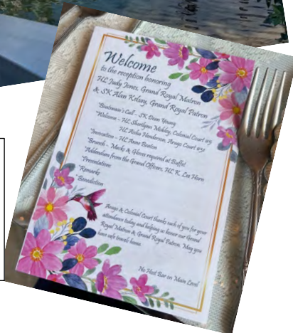
A nice program was put together by the members of Colonial Court and Arago Court.